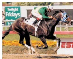
Gourmet Girl ($1,255,373)