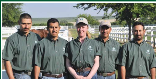
River Ranch Division